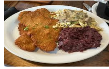
Schnitzel Dinner Over 385 sold