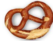
Pretzels Over 150 sold