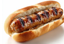
Bratwurst Over 300 sold